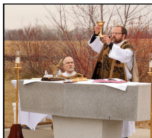
image: All Souls Day Mass at the cemetery

Helps fulfill our parish's responsibility to maintain and care for Holy Cross South Cemetery, honoring those laid to rest and providing a dignified, sacred place for prayer and remembrance.