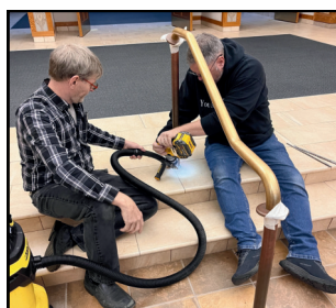
image: repairing Gathering Space handrail

Provides for ongoing building and facility maintenance, repairs, and improvements—helping us be good stewards of the parish property entrusted to us.